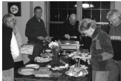
Event Hosts enjoying a GREAT spread!