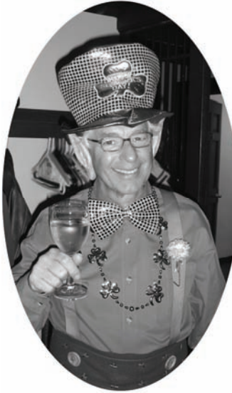
Billy the Leprechaun says "Sláinte!"