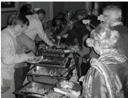
Dinning on corn beef and cabbage