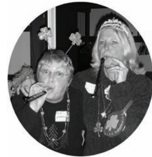
Éirinn go Brách - Ireland Forever