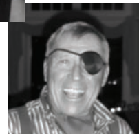
The Flapper and the "Hathaway Man"