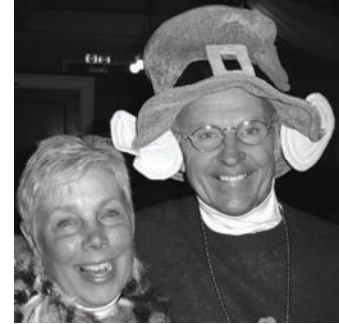
"Tabhair póg dom, táim Éireannach!" (Kiss me I'm Irish)